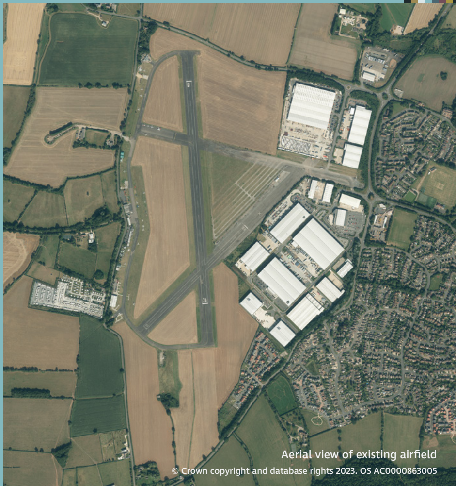
Aerial view of existing airfield

© Crown copyright and database rights 2023. OS AC0000863005